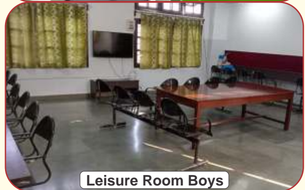
Leisure Room Boys