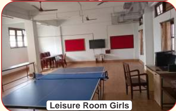
Leisure Room Girls